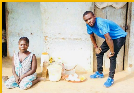
Identified case of hunger during outreach

(project team covered all charges with the assistance of local development stakeholders in the community). In the course of outreach activities, the team responded to some crisis affected population (present socio-political crisis in the south west region of Cameroon), by providing nutritious food items, (women and children) in manyu division (bachou akagbe, bachou ntai, mile 18 and mamfe town. Regular supply of food (rice, cooking oil, salt, magi, soap, tooth brush and paste to the desperate affected-Cases).