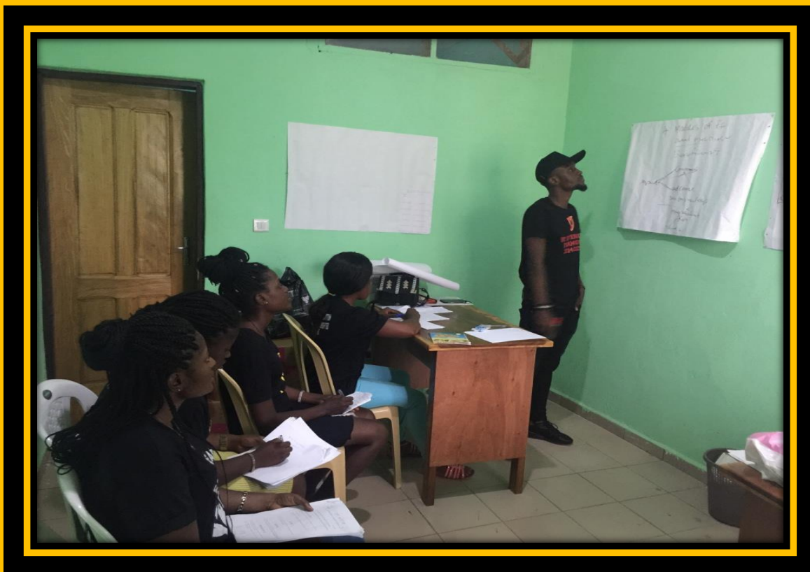
(Project team in preparation for outreach)

“REINFORCING PEER EDUCATION IN OUR COMMUNITIES FOR A BRIGHTER FUTURE”